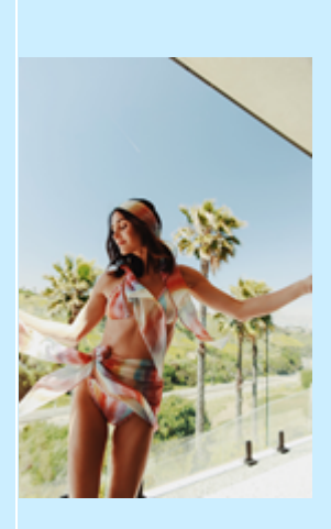
DANNIJO x Gianni Bini swimwear is available exclusively at Dillard's.