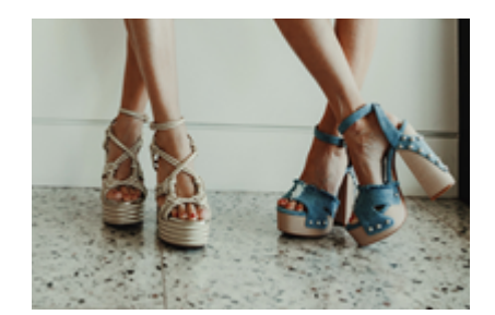
DANNIJO x Gianni Bini footwear is available exclusively at Dillard's.