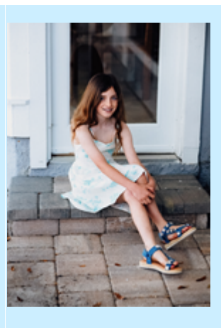
DANNIJO for Gianni Bini is available exclusively at Dillard's.