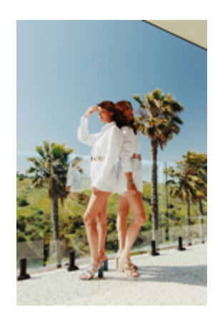
DANNIJO x Gianni Bini is available exclusively at Dillard's.